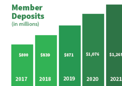
Member Deposits (in millions)