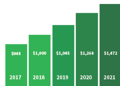
Asset Size (in millions)