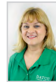
10 YEARS HOPE MICHEL